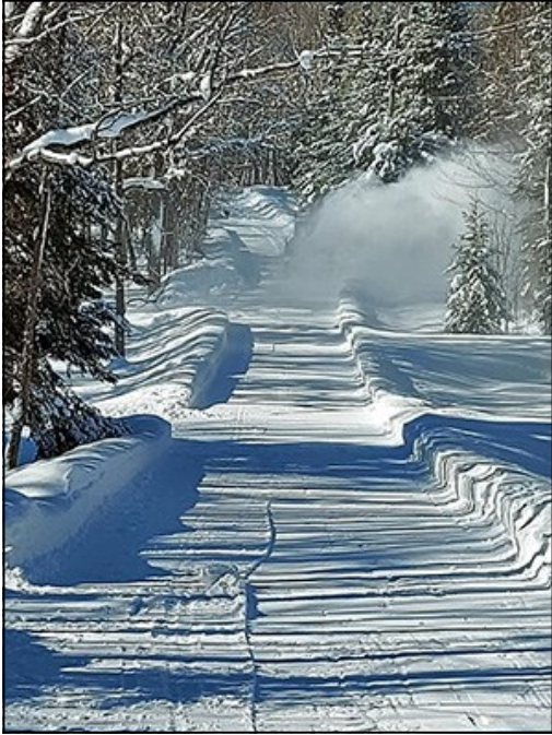
Snow Plow

Special thanks to all members who provided seasonal and very festive signage along Star Lake Woods Road. Now we know how far it is to the North Pole!