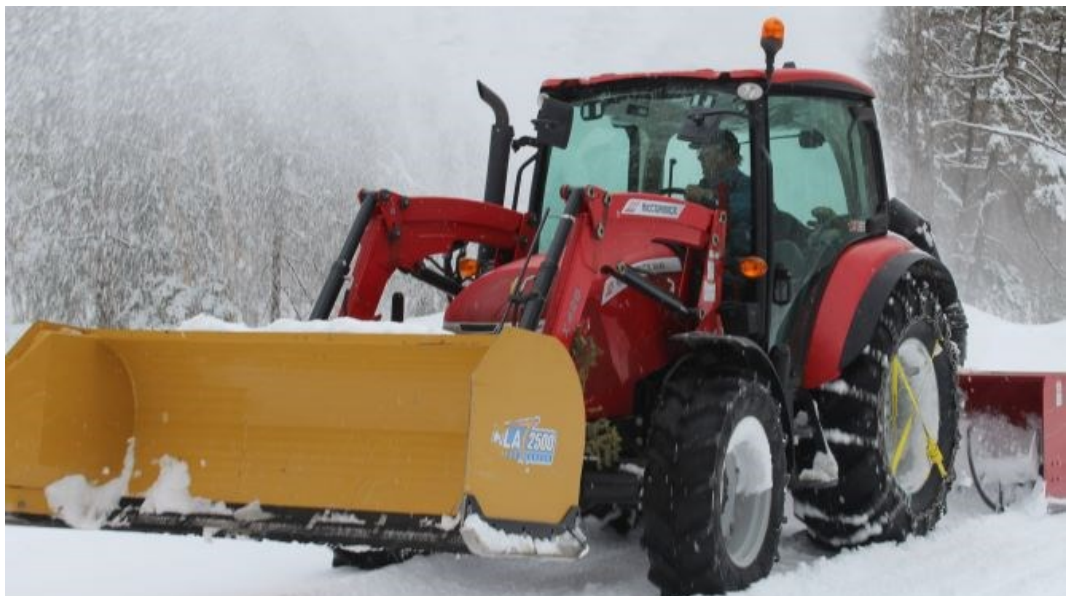
Clearing The Roads Again!