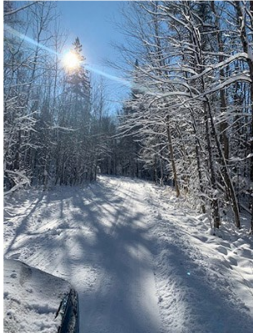
Sun through the trees, Photo: Debbie Coulombe