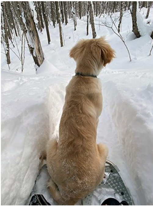
Chief Snowshoeing