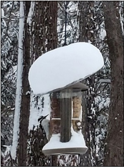
Hairy Woodpecker