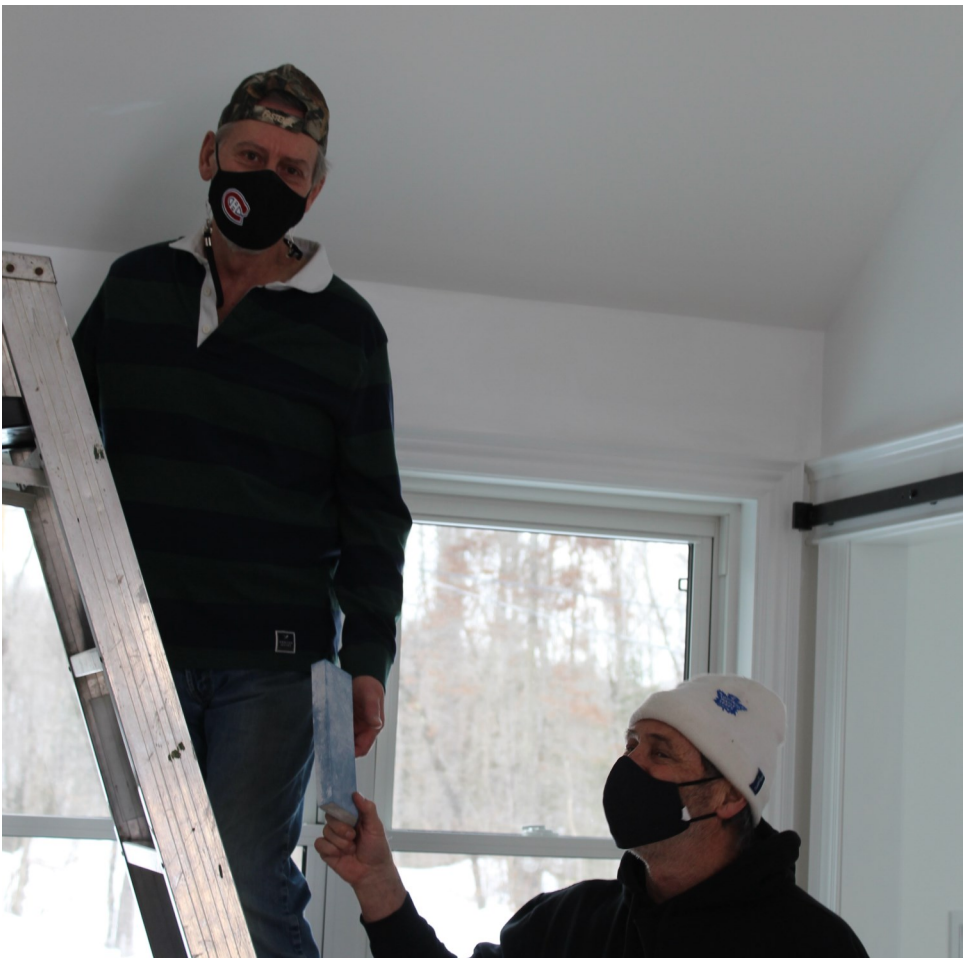
Hockey Foes But Good Cottage Neighbours Safely Lending a Helping Hand!