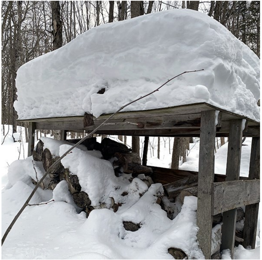
Wood Shed Snow