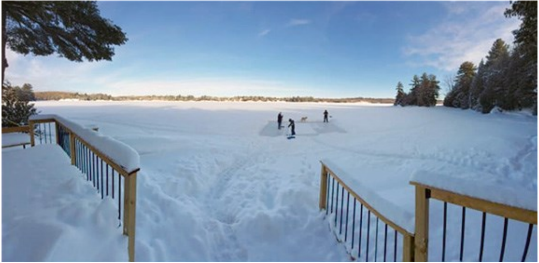
Clearing a Rink