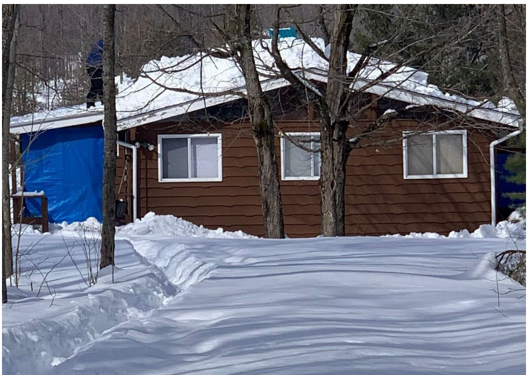
Shovelling The Roof: Courtesy: Bothwell Cottage