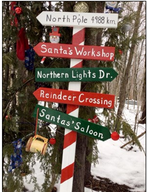
Winter Signs