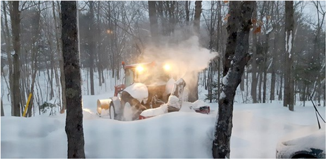
Plowing The Roads