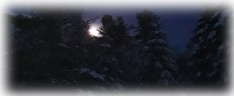
Full Moon In the Star Lake Night Sky

Copyright © 2021 Star Lake Woods Association, All rights reserved.