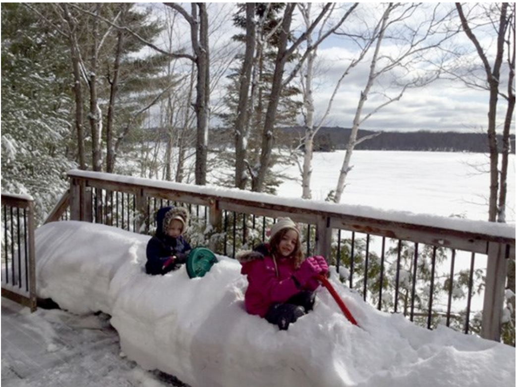
Snow Canoe