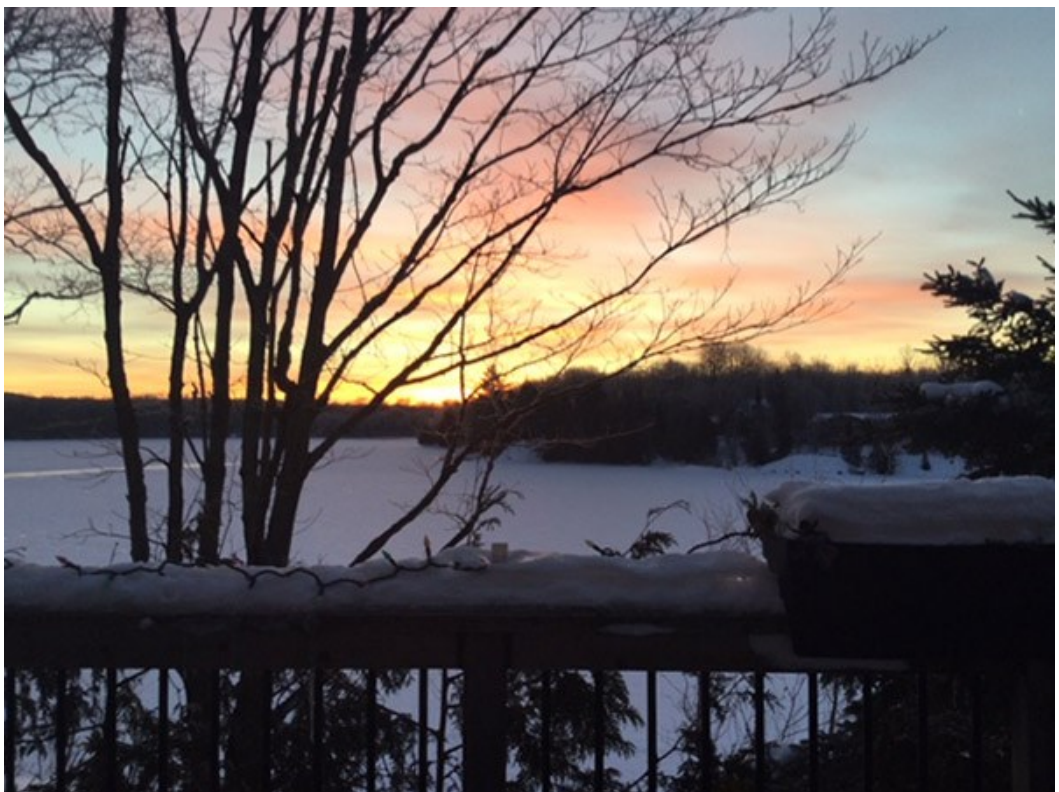
Sunrise over the Frozen Lake