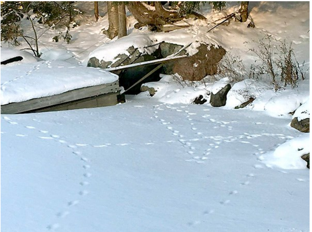
Animal tracks in the snow