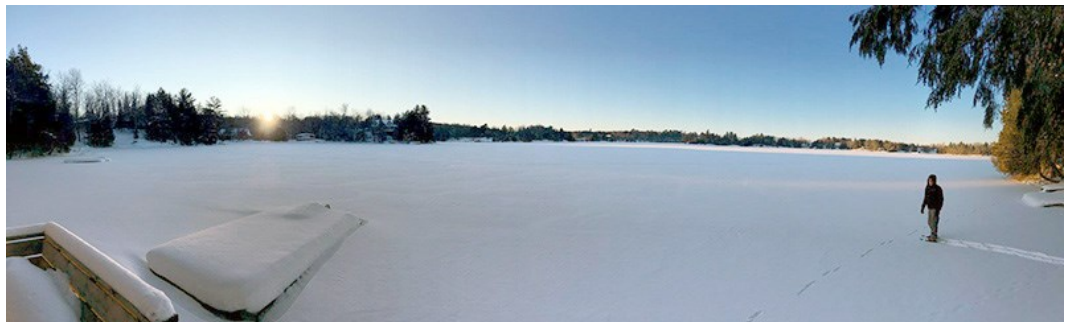
Venturing out on the ice