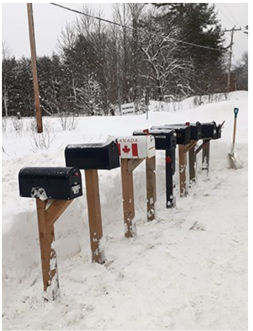
Mailboxes shoveled out