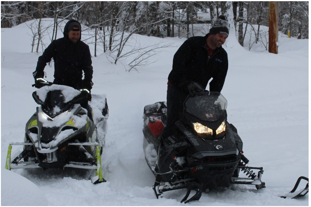
Snow, Snow, Snow!