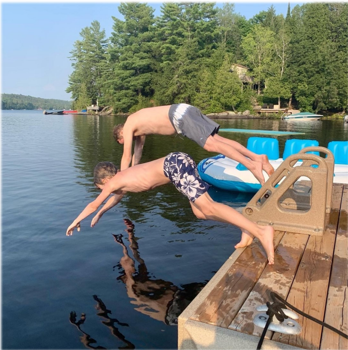
Father & Son Dive