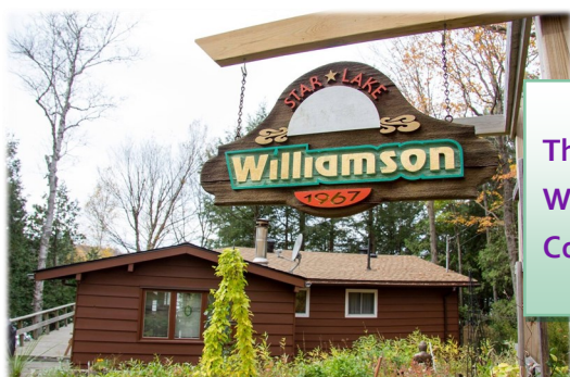
The Williamson Cottage - 2019