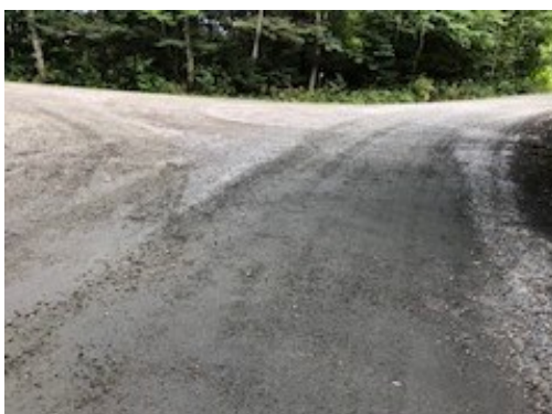
Star Lake Woods Road at the fork