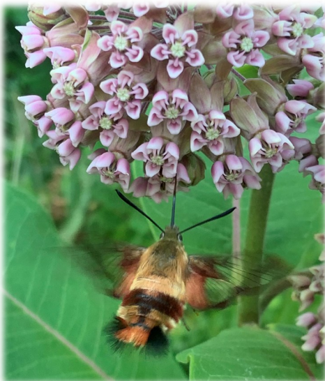
Hummingbird Moth

They look like hummingbirds, hover in midair like hummingbirds, hum like hummingbirds and drink nectar from the same flowers -- yet hummingbirds and the extraordinary moths that mimic them aren't remotely related. Hummingbird moths range throughout North America, but spotting this masterpiece of Mother Nature is a rare treat. Yet some of our members have spotted them this summer! You'll see more pictures in the Our Special Environment section of this issue. If you'd like to increase the odds of catching one in action, make sure their favorite food sources are well represented in your garden. Keep your eyes peeled during the day and close to dusk when they're most likely to appear.