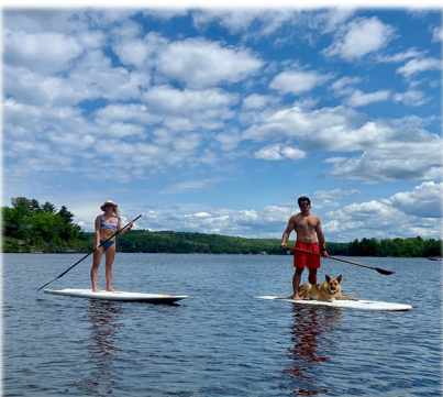
Paddle Boarding