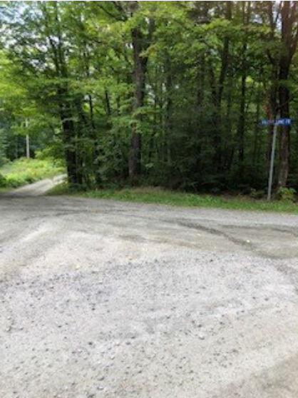
Hilltop Lane from Star Lake Woods Rd.