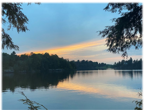
Beautiful Sunset