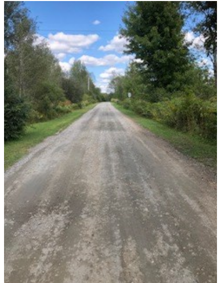
Morningside Drive from top of hill