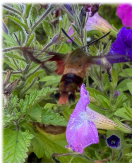
2 Hummingbird Moth Photos Courtesy Kelly Long