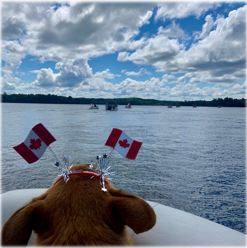
Canada Day Parade on Star Lake