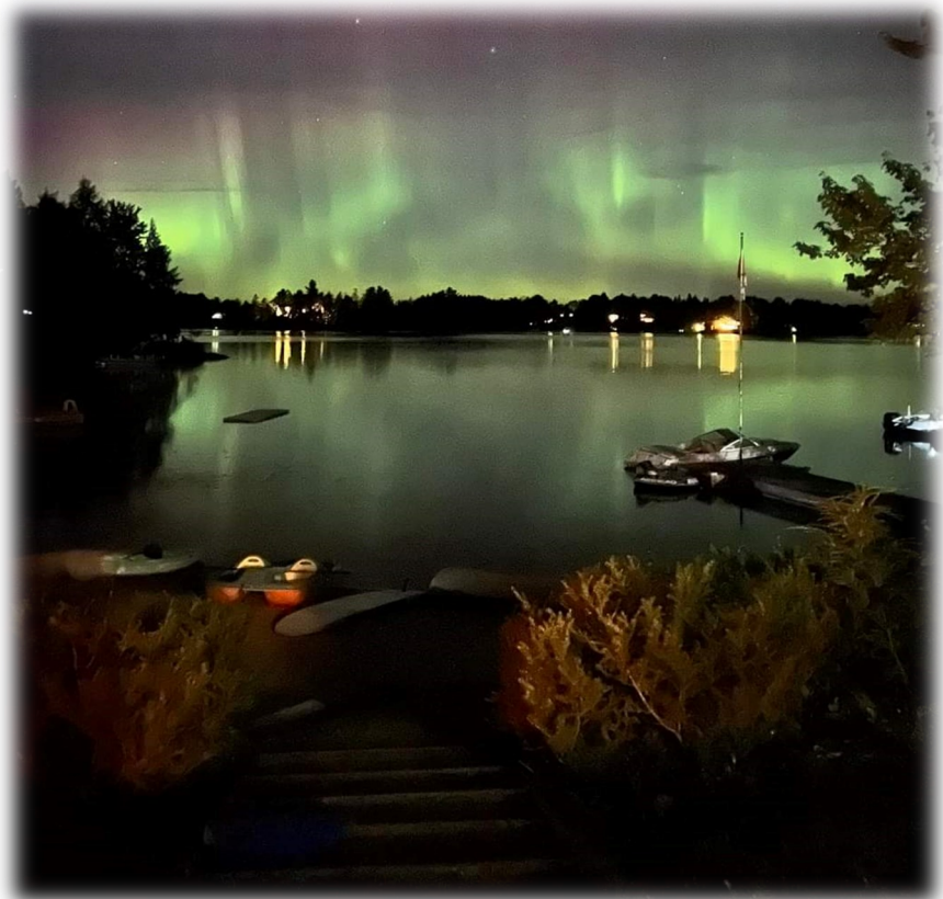
Northern Lights

Copyright © 2022 Star Lake Woods Association, All rights reserved.