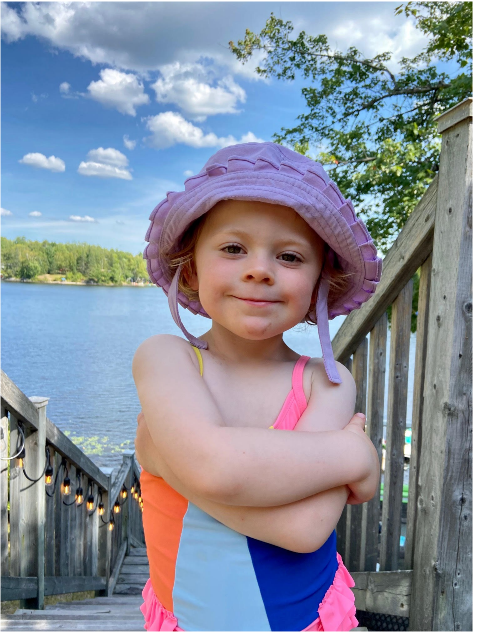
I'm not telling!