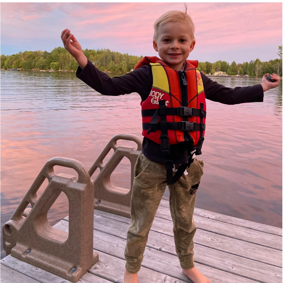
Where are the fish?